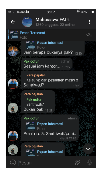
Figure 1: Information Media Communication Service via Telegram

The image explains how education personnel transfer notifications about taking academic calendars where students communicate using telegrams related to the service.