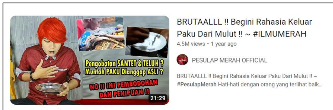
Figure 2. Tackling Occult Alternative Medicine with Trick Reveal Content

What the Pesulap Merah did in his action to overcome supernatural medicine was to dismantle the practices of ustadz or kyai in the name of religion doing supernatural healing deeds. Treatment under the guise of spices coupled with supernatural things is a means that can bring about musyrikan because it believes in other than the Lord Allah SAW in Islam. This is among other things showing that the tricks carried out by shamans under the guise of being an ustad are disassembled with similar tools that can be operated with supporting magic tools that can be found in special markets for mystical items, such as daggers, jenglot dolls, nails, agates and items supporting supernatural healing actions.