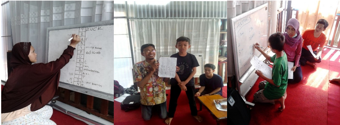
Figure 4. Students Practice and Present Their Works

cognitive processing (Skulmowski & Rey, 2017). Second, the project challenges the deficit narrative often associated with underprivileged learners. Instead of focusing on what the children lacked, the program leveraged their natural curiosity and capacity for play. By using games and songs, the project reframed English not as a daunting academic subject, but as a medium for fun and interaction. This approach is crucial for building a positive "L2 Learning Experience," which is a key driver of long-term motivation (Dörnyei, 2019).