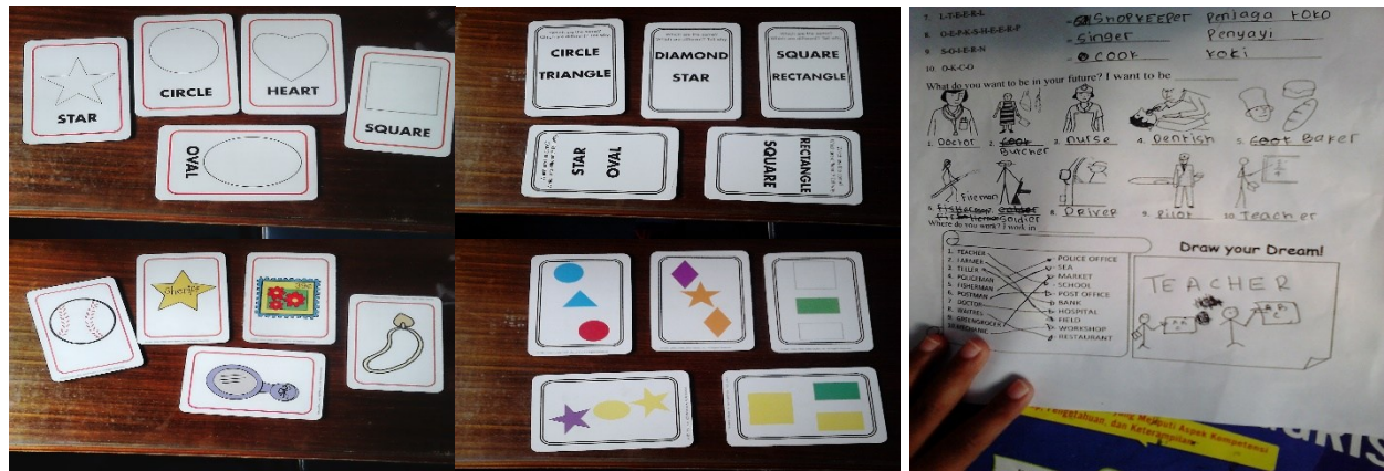
Figure 1. The use of Flash Card and Worksheet