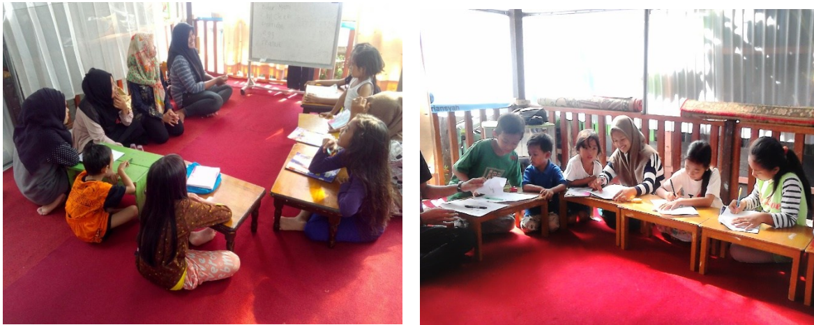
Figure 3. Students' Enthusiasm in Joining the Learning Activities

pleasant side effect but a core pedagogical achievement that directly facilitated the acquisition process by allowing learners to be more cognitively and emotionally open to the target language.