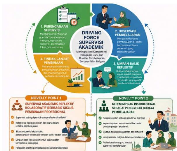
Figure 2. Interactive Academic Supervision Cycle Model

demonstrates that improvements in pedagogical competence and learning effectiveness continuously reinforce teacher professionalism, which in turn supports the sustainability of academic supervision practices and ongoing instructional improvement within the school.